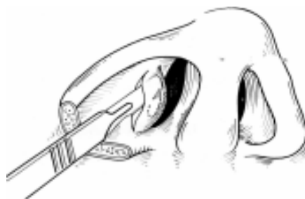
Figure 2. Development of an inferior-turbinate flap. Alotomy is outlined for demonstration purposes. Reprinted with permission from Laryngologie, Rhinologie und Otologie , 1980, 59, 50-60.

During a period of 4 1 years, from January 1982 till July 1986, the inferior-turbinate flap has been used in 35 patients. In the same period another 5 patients have been treated surgically for a septal perforation with other techniques. Of the 35 patients, 4 patients were lost to follow-up. Of the remaining 31 patients, 16 were female and 15 male. They varied in age from 19 to 58 years, the average age being 37 years. The mean follow-up at that time of reporting is 16 months, varying from 3 to 39 months. The known causes of the perforations as well as the complaints of the patients have been summarized in Tables 1 and 2. Ten patients had been previously treated elsewhere, with different surgical techniques. Four of these 10 patients had been operated upon more than once. In 4 of the total of 10 surgically treated patients a prosthesis had been applied unsuccessfully.