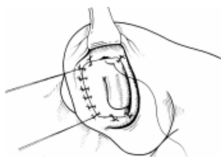
Figure 3. Inferior-turbinate flap is sutured to the mucosa on the opposite site of the septum anteriorly, inferiorly and superiorly. Division of the pedicle of the flap posteriorly requires a second stage. Reprinted with permission from Laryngologie, Rhinologie und Otologie , 1980, 59, 50-60.

Another 7 patients had been treated before with a prosthesis only.